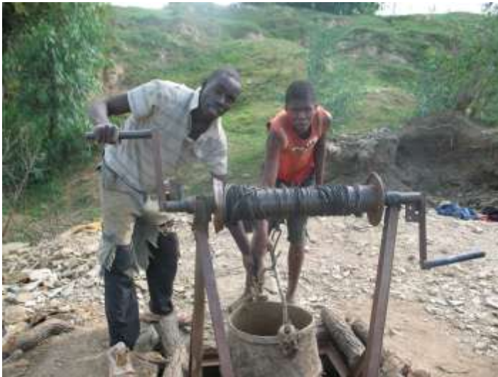
Figure 3. Method of gold extraction in Gwanda

In most countries, miners use nitric acid (30%) to dissolve the mercury in the amalgam. It is dangerous and an expensive procedure as it is difficult to precipitate all the mercury from the nitric solution. The process is usually done by introducing pieces of metal such as aluminium, copper, or zinc in the solution. In this way the remaining nitric solution cannot be discarded because it is extremely corrosive and still contains residual mercury (Huidobro, 2006). The most common process to separate mercury from gold is the decomposition (i.e., “ roasting ” or “ burning ”) of the amalgam by heating above 360°. Most mercury compounds evaporate at temperatures above 460° and gold must reach almost 3000° to evaporate. When heated, mercury becomes volatile leaving the gold in solid state. Figure 3 illustrates a picture of gold panners in Gwanda, busy with a dangerous way of gold extraction, with two men pulling out a bucket with raw material while underground there is a person digging and loading the stones in the bucket.